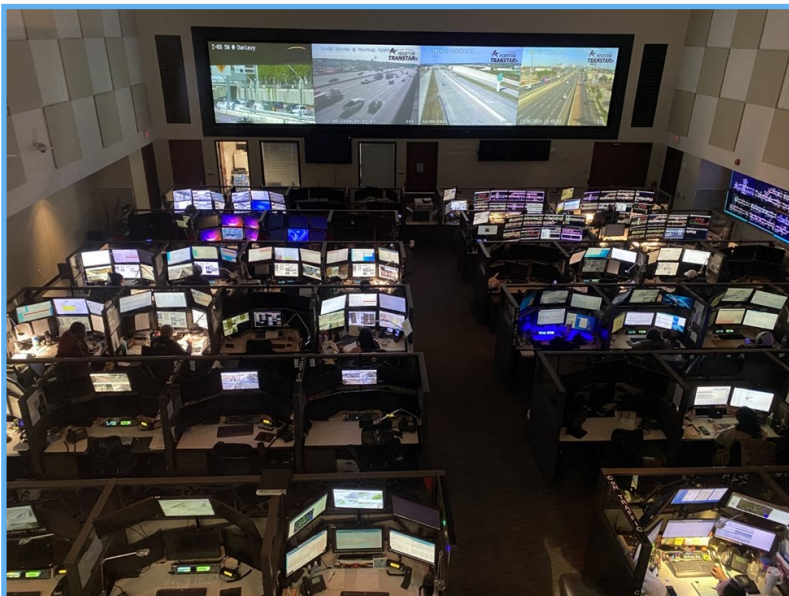
The Traffic Control Room at TranStar

Everyone had a FANtastic time. Consider joining us on a future trip.