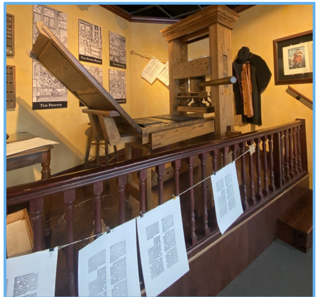
The Dunham Bible Museum

At TranStar – Ladies in alphabetical order: