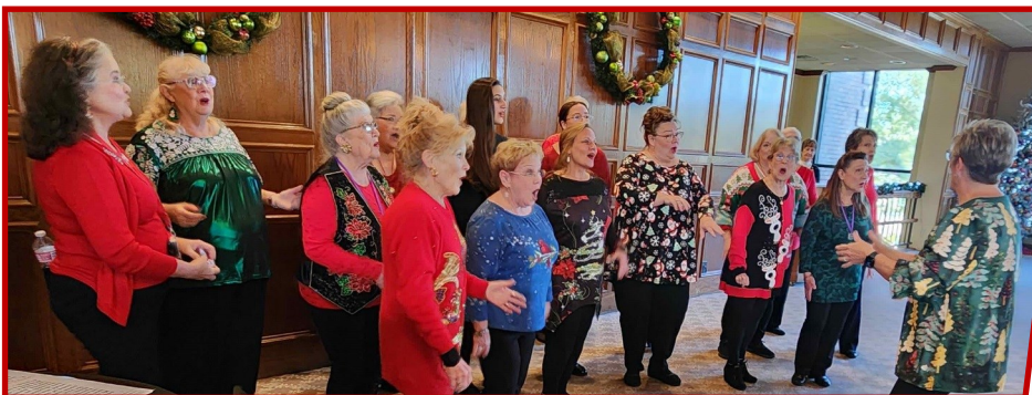
The Woodlands Show Chorus was so talented and entertaining!