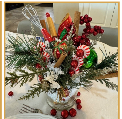
The beautiful centerpieces Gayla Baker created.